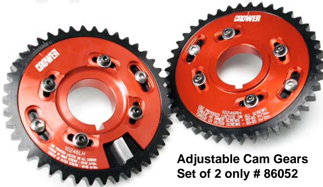
Adjustable Cam Gears Set of 2 only # 86052

CROWER thanks you for purchasing our racing products and for choosing us as your number one source for all your racing needs. Before installing the cam gears, please review this sheet to obtain instructions on how to install your CROWER cam gears, and also make sure you review the limited warranty information. Make sure to visit our web site at www.crower.com for other great products.